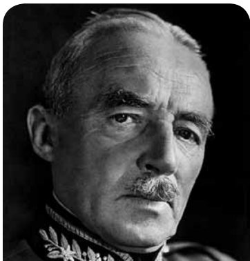
Henri Guisan, Commander-in-Chief of the Swiss army from 1939 to 1945

Historians have questioned some of his strategic decisions, particularly concerning the National Redoubt, but everyone is agreed about his charisma, his ability to create a consensus, and the confidence he inspired in the army and the Swiss population.