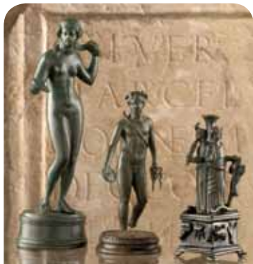
Bronze statuettes of Venus, Apollo and Hecate

In 2009 to celebrate its 30 th anniversary, the museum undertook a major renovation. This year, from 29 May to 31 October, it will present the exhibition "What's new, doctor?" devoted to health and medicine in the Roman era.